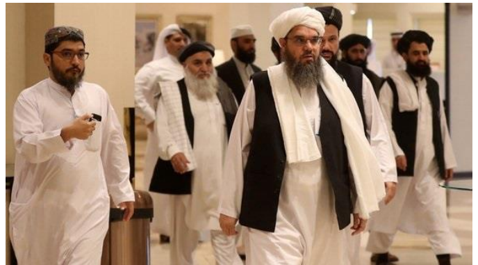
لزوم ایجاد سازوکار نظارتی بر آتش‌بس احتمالی